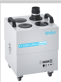
Fume extraction devices