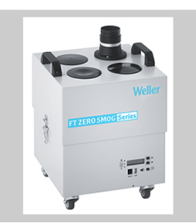
Fume extraction devices