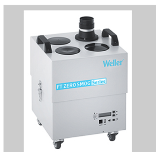
Fume extraction devices