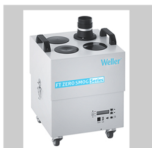
Fume extraction devices